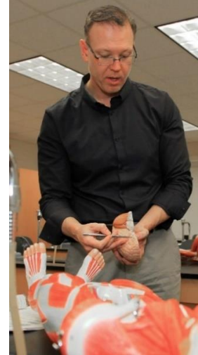
Teaching anatomy students the cranial nerves.