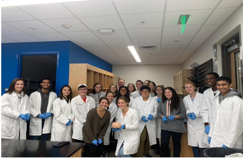
One of the many hands-on lab activities I coordinate outside of class time. The above lab activity involved dissecting a human brain. The students are members of the Georgia Tech Neuroscience Club. The brain shown is a plastic model.