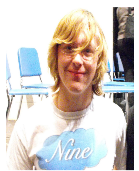
Sir Elwin The Brave